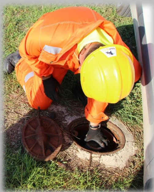
Checking the Low Pressure valves