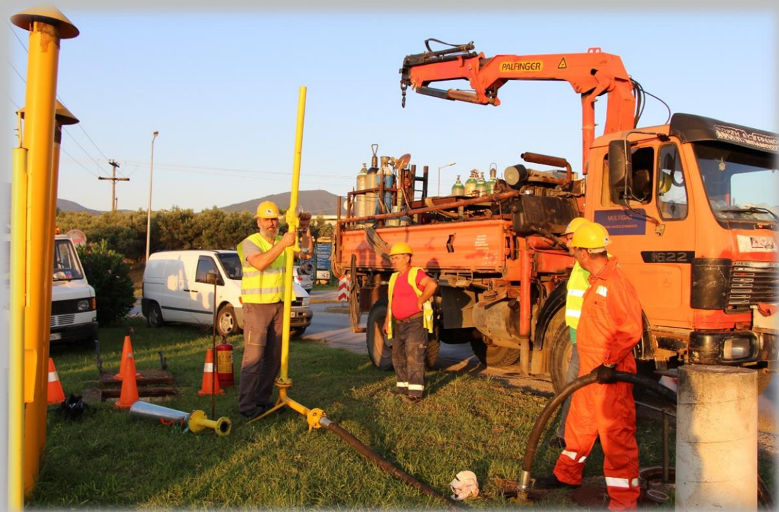
Decompression of the Natural Gas Network

➤ Interventions by EDA THESS Technicians