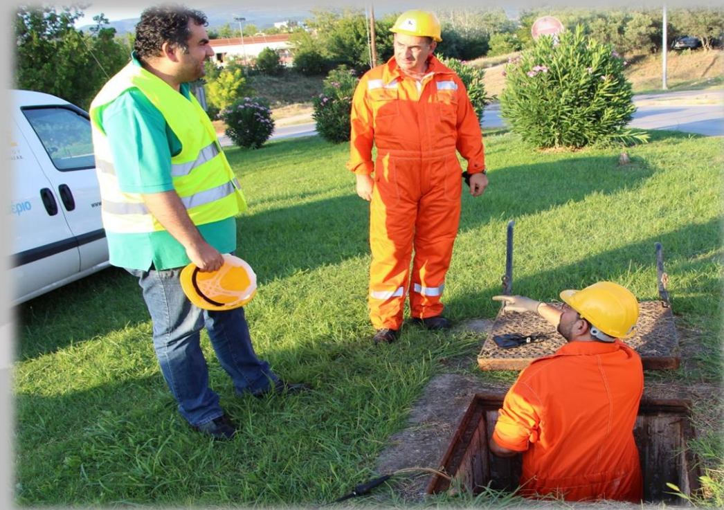
Restoration of Natural Gas Supply