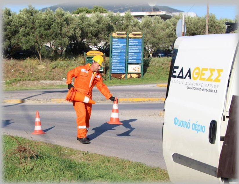
Securing the surrounding Area

For safety reasons the supply must be shut off by closing the main valve B-159